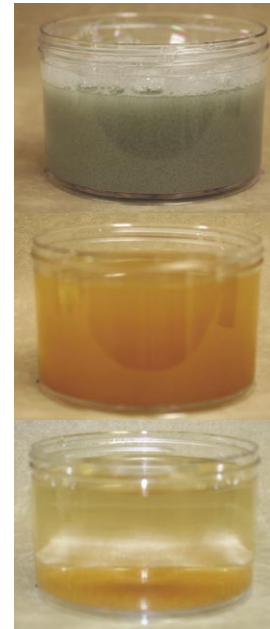
Conventional Iron Phosphate

Zirconization reduces sludge and scale build-up typical of conventional iron phosphate process.