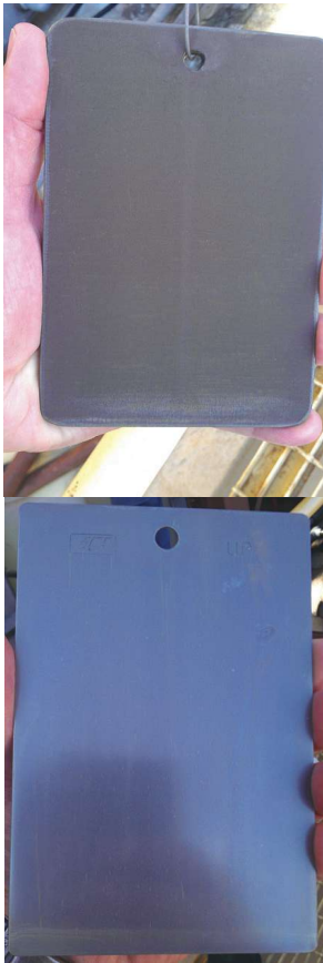
Figure 3 Top: Heavy zirconium oxide coating on hot rolled steel. Bottom: Heavy zirconium oxide coating on cold rolled steel.

phosphates in water is a strategy aimed at reducing eutrophication (Footnote 2). Adopters of TMC pretreatments often claim a green pretreatment strategy; the disposal procedures are generally inexpensive and uncomplicated.